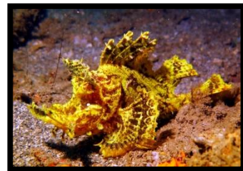
VAST DIVERSITY OF LIFE UNDERWATER